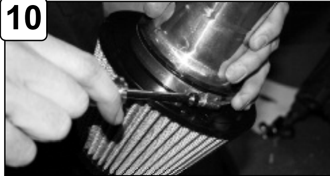
10 Install air filter to intake tube and tighten using 5/16" nut driver.

GRReddy Performance Products 9 Vanderbilt, Irvine CA 92618 T: 949.588.8300 F: 949.588.6318 tech@greddy.com www.greddy.com