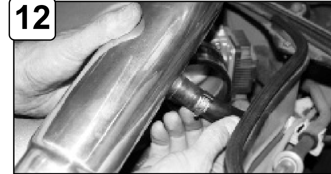
12 Attach crank case line to intake tube.