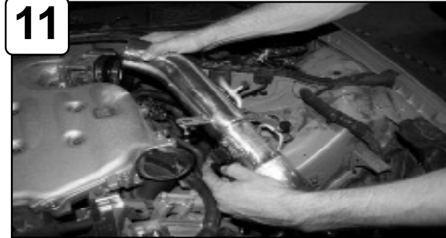
11 Align intake to coupler on throttle body and bracket location.