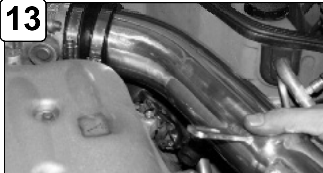
13 Insert tube into couplings. Locate hole on tab to mounting location on engine plenum.