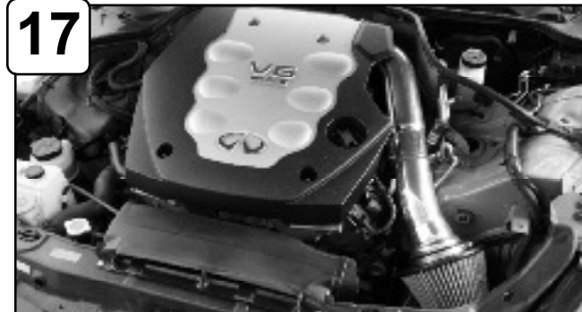
17 The installation of your Greddy Performance intake is now complete. Please check all components and re-tighten if necessary. Thank you for choosing Greddy!