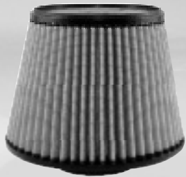
Replacement Filter P/N: 61-90128

Note: Filter Cleaning: When cleaning your Pro Dry 5™ filter, be sure to use only "Restore Kit" (Takeda P/N: TP-7016C Pro Dry 5™ cleaner only.)