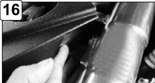
16 Reconnect MAF sensor harness.