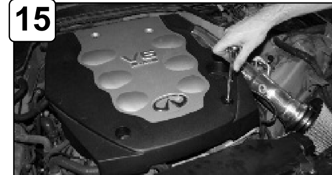
15 Re-install engine cover and tighten using 10mm socket or wrench.